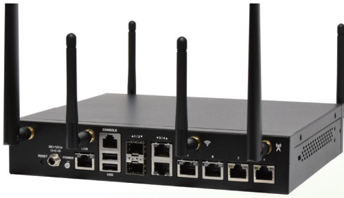
Images are for reference only. See ordering information for SKU details.

Desktop Network Appliance Powered by Intel® Atom® C3000 (Denverton) CPU