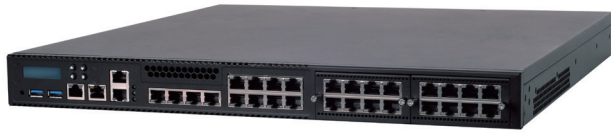
Images are for reference only. See ordering information for SKU details.

1U 19" Rackmount Network Appliance Built with Intel® Xeon® E or Core i3 or Pentium or Celeron Processor (Codenamed Coffee Lake)