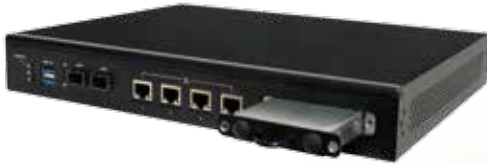
Images are for reference only. See ordering information for SKU details.

Wide Temperature Network Appliance Powered by Intel® Atom® C3000 (Denverton)